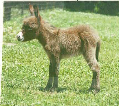
HHAA Miss Fahrenheit 2.jpg

The American Donkey and Mule Society, PO Box 1210, Lewisville TX 75067 www.lovelongears.com/ (972) 219-0781 The American Donkey and Mule Society is not responsible for errors in information submitted to the registry.